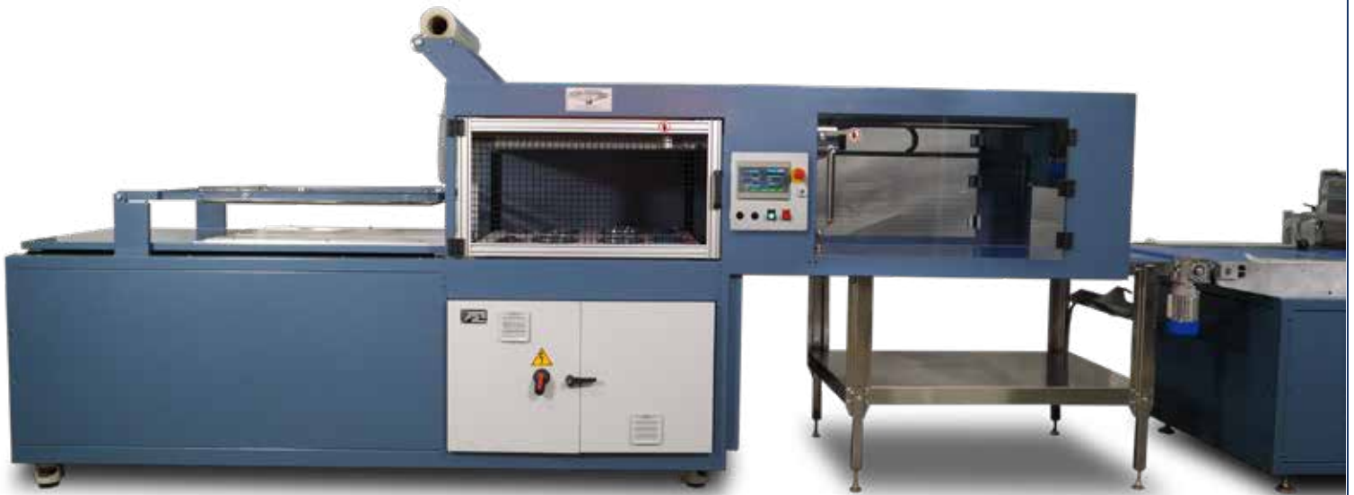
ASP-3036 WITH AUTOMATIC UNLOAD & CONVEYOR

EXPERIENCE the STARVIEW ADVANTAGE INNOVATIVE PACKAGING MACHINES