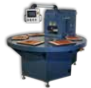
ERB6 / ERB8