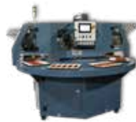
FAB6 / FAB8