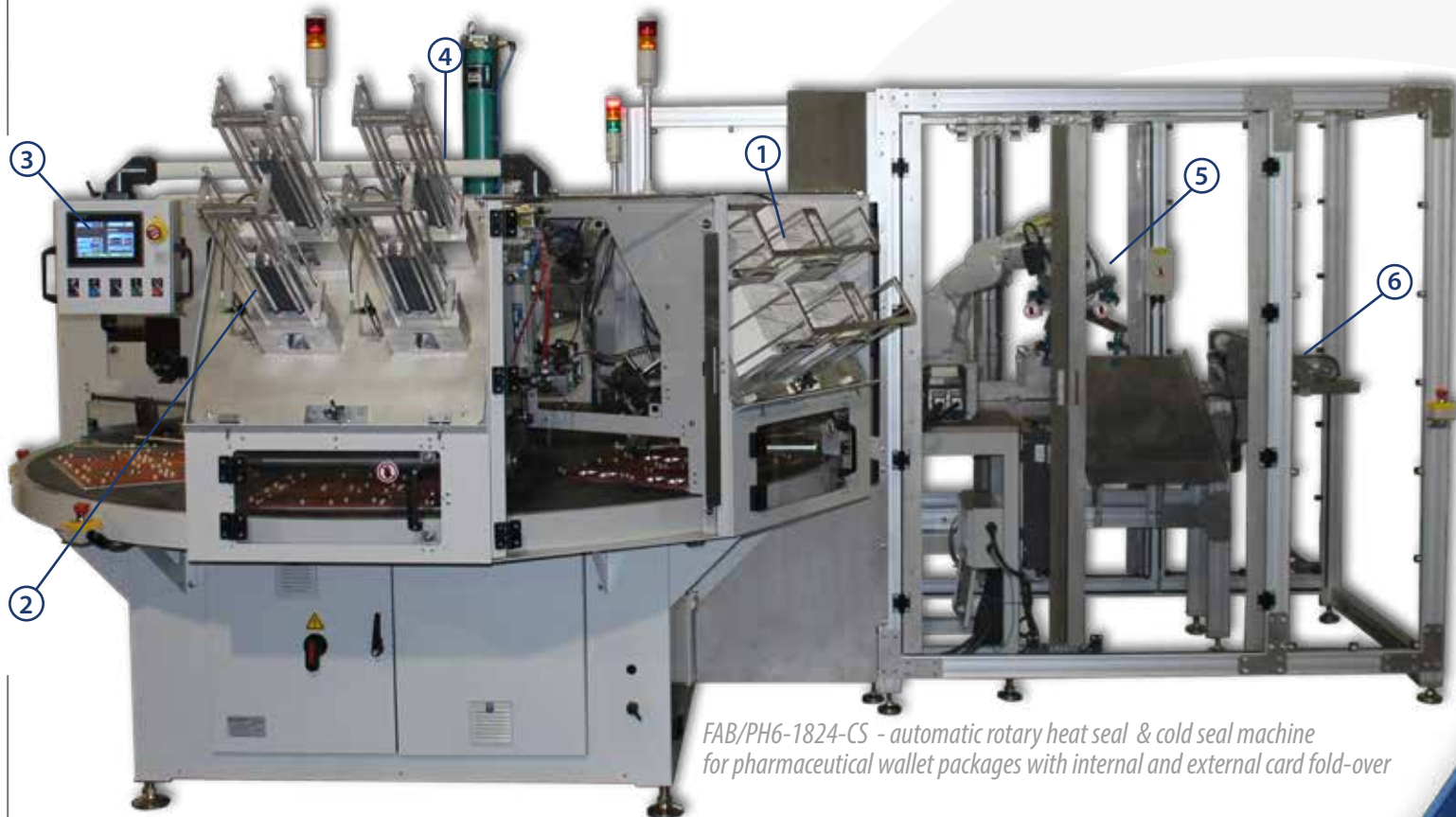
FAB/PH6-1824-CS - automatic rotary heat seal & cold seal machine for pharmaceutical wallet packages with internal and external card fold-over

1 - Automatic wallet blister card feeder 2 - Automatic pill pack product feeder 3 - HMI / PLC – touch screen control