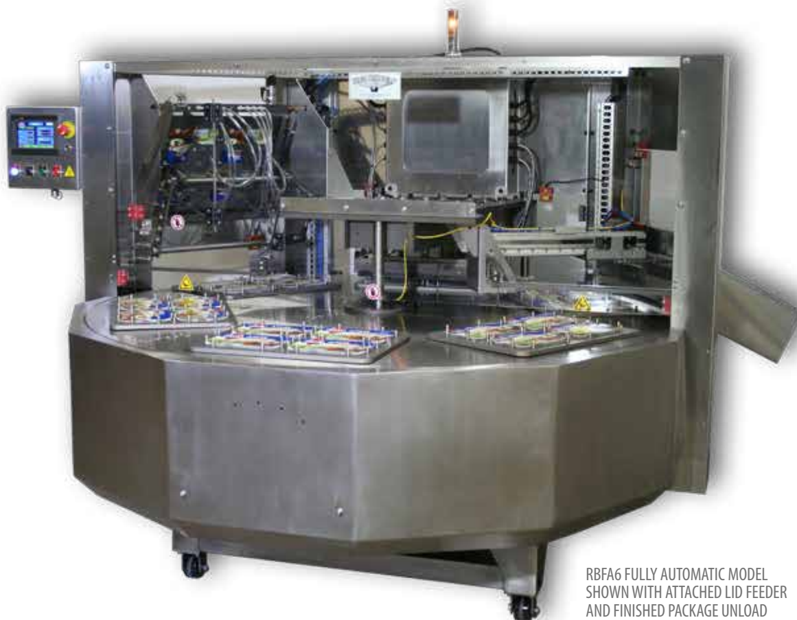
RBFA6 FULLY AUTOMATIC MODEL SHOWN WITH ATTACHED LID FEEDER AND FINISHED PACKAGE UNLOAD

EXPERIENCE the STARVIEW ADVANTAGE INNOVATIVE PACKAGING MACHINES