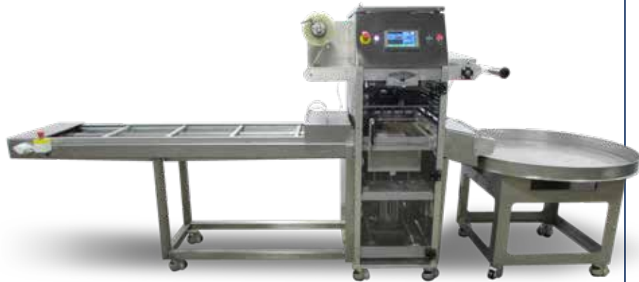
AIMS-1220 WITH OPTIONAL ACCUMULATION TABLE