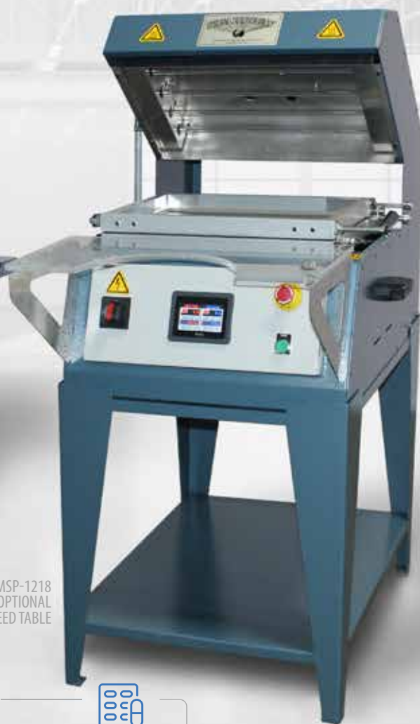
MSP-1218 WITH OPTIONAL FLOOR STAND AND OUT FEED TABLE