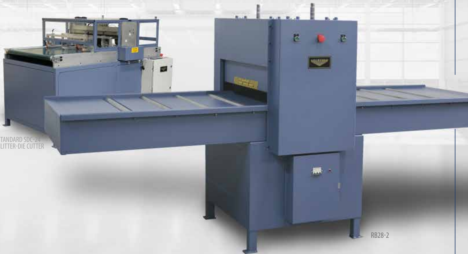
STANDARD SDC-24 SLITTER-DIE CUTTER

ROLLER AND AUTOMATIC SLITTING DIE CUTTING MACHINES