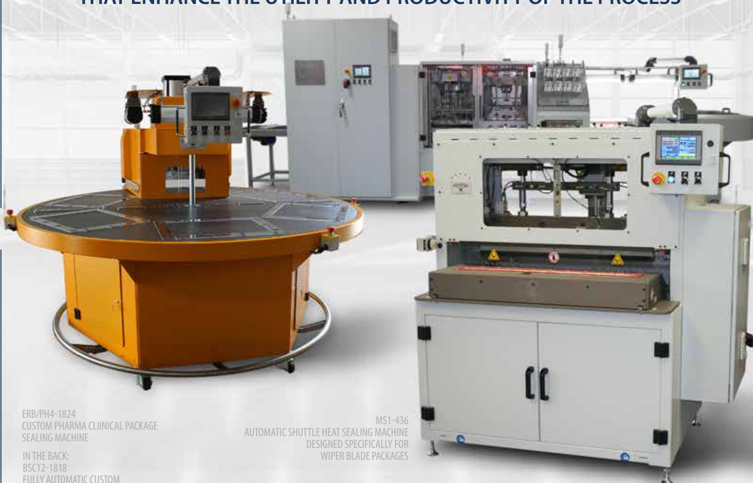
ERB/PH4-1824 CUSTOM PHARMA CLINICAL PACKAGE SEALING MACHINE

CUSTOM DESIGNED MACHINES THAT ENHANCE THE UTILITY AND PRODUCTIVITY OF THE PROCESS