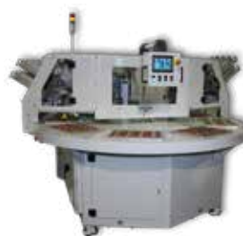
MEDICAL / PHARMACEUTICAL