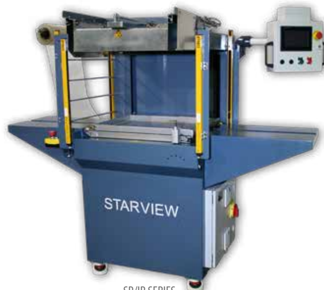
SP/IR SERIES WITH OPTIONAL CASTERS, LIGHT CURTAINS AND AUTOMATIC FILM CLAMPING SYSTEM

EXPERIENCE the STARVIEW ADVANTAGE INNOVATIVE PACKAGING MACHINES