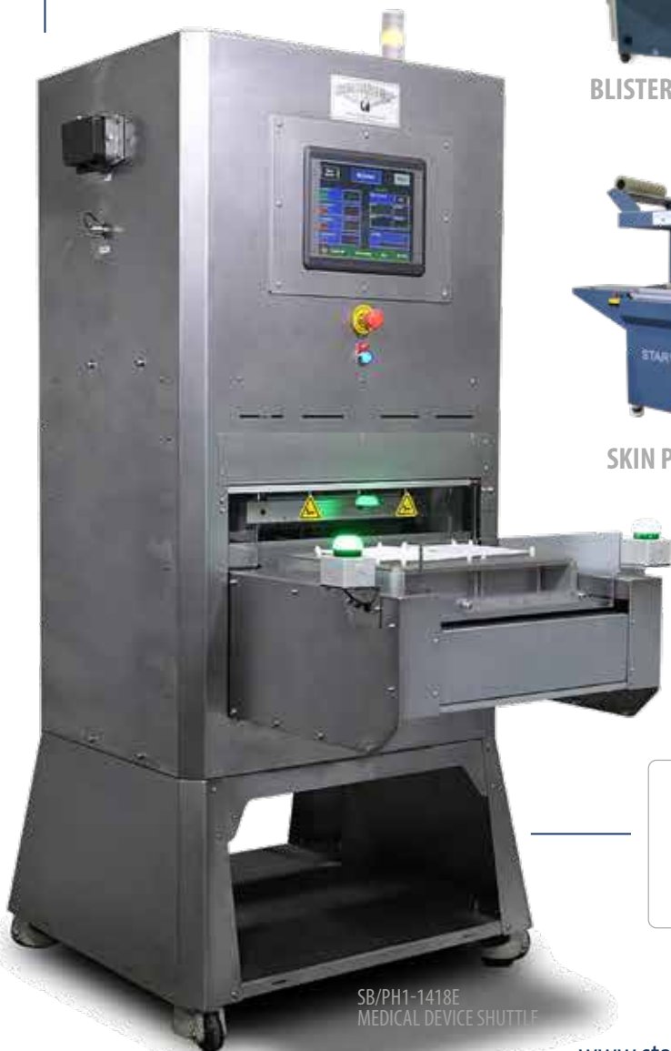
SB/PH1-1418E MEDICAL DEVICE SHUTTLE