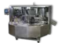
RBF & RBFA