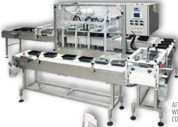
AIMS-1220-3 WITH OPTIONAL UNLOAD CONVEYOR CODE DATE SYSTEM