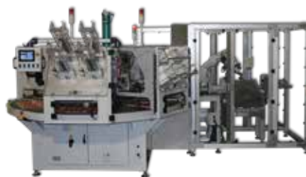
AUTOMATION & INTEGRATION