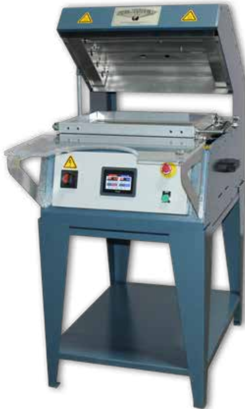
MSP-1218 WITH OPTIONAL FLOOR STAND AND OUT-FEED TABLE