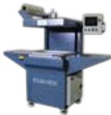
SP & SP/IR