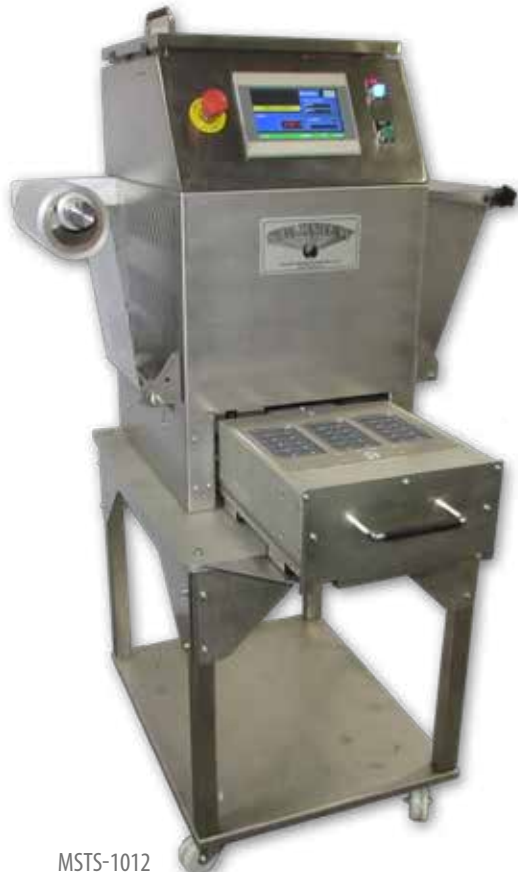
MSTS-1012 WITH OPTIONAL STAND