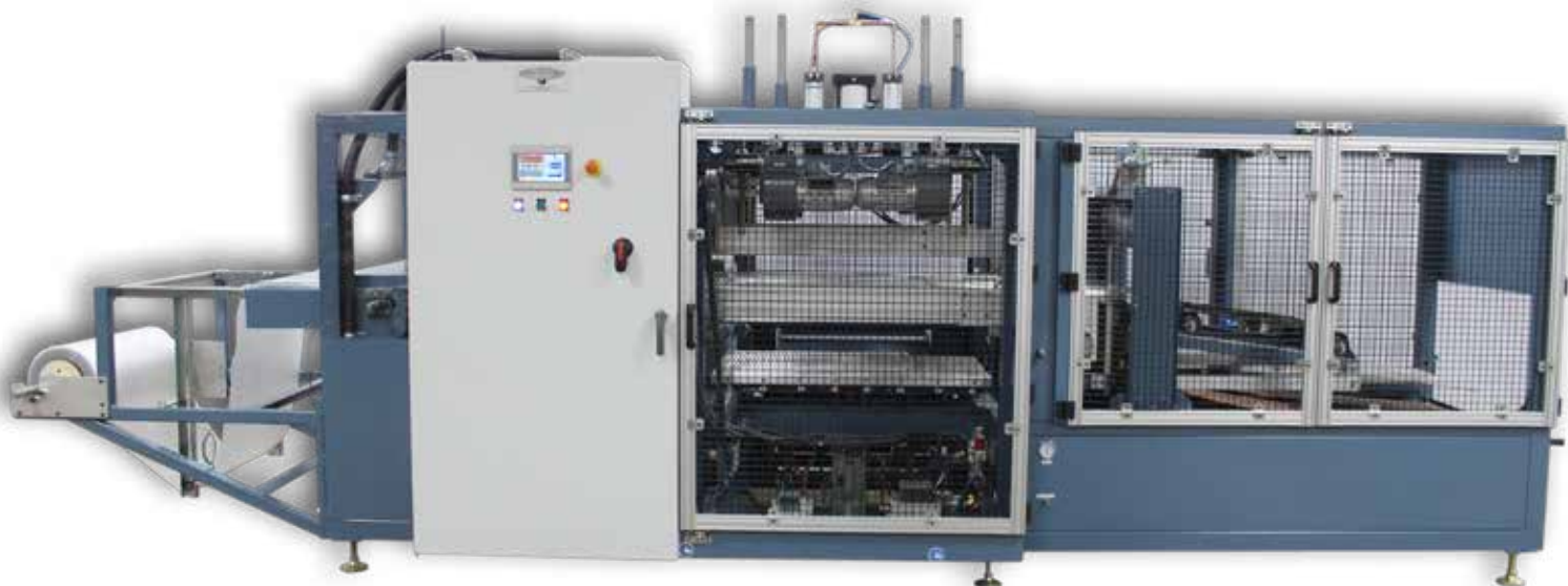
STANDARD IF SERIES AUTOMATIC VACUUM FORMING MACHINE

EXPERIENCE the STARVIEW ADVANTAGE INNOVATIVE PACKAGING MACHINES