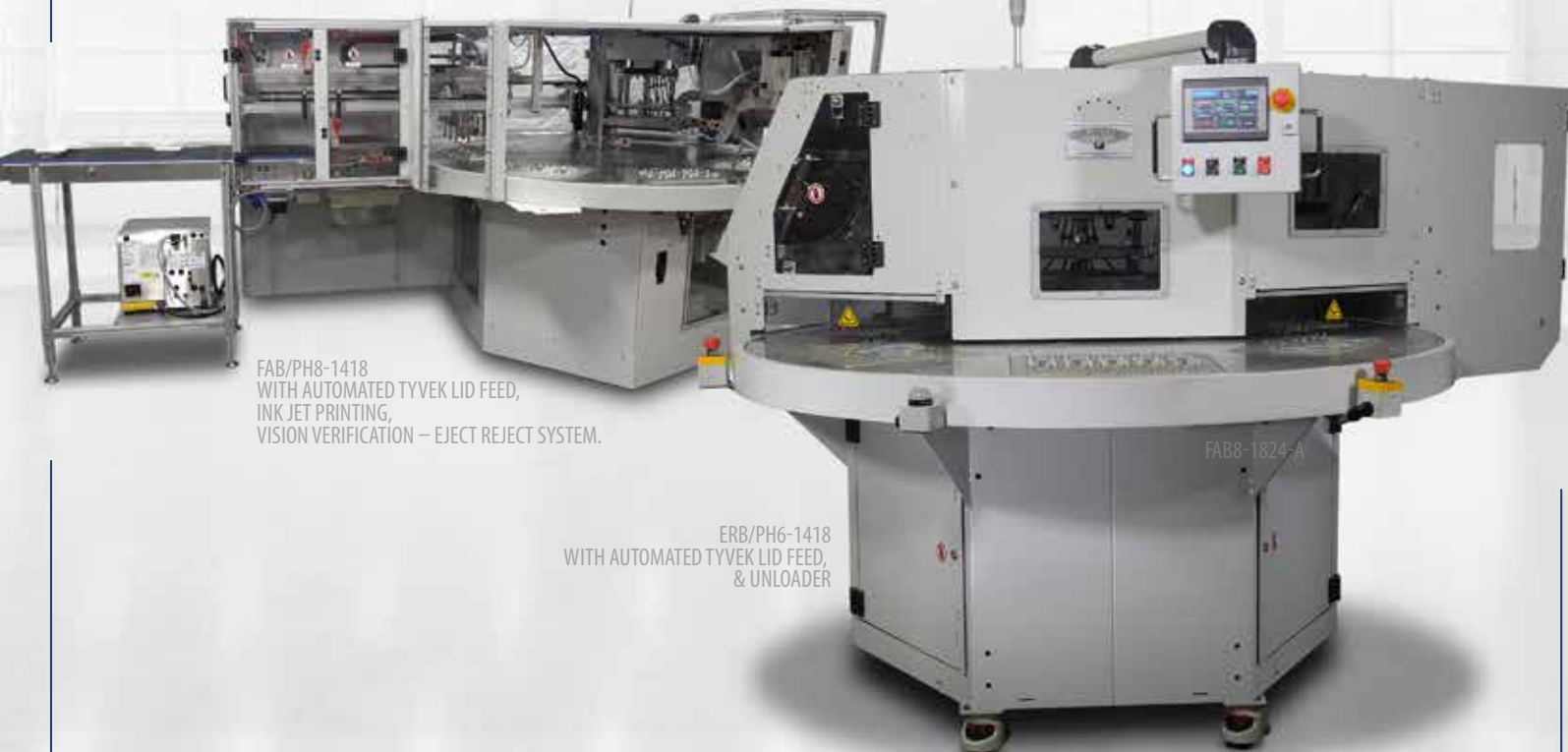
FAB/PH8-1418 WITH AUTOMATED TYVEK LID FEED, INK JET PRINTING, VISION VERIFICATION – EJECT REJECT SYSTEM.

FROM MANUAL SHUTTLES, TO SEMI-AUTOMATIC ROTARIES TO FULLY AUTOMATIC ROTARIES, CAROUSELS & INLINE PACKAGING MACHINES