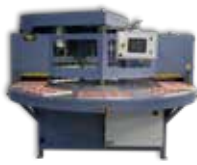
PH3 / PH6 / PH8

Click on miniature for more information about that series of Packaging Machines