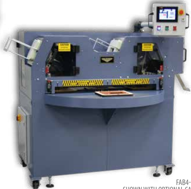
FAB4-1012 SHOWN WITH OPTIONAL CASTER

EXPERIENCE the STARVIEW ADVANTAGE INNOVATIVE PACKAGING MACHINES