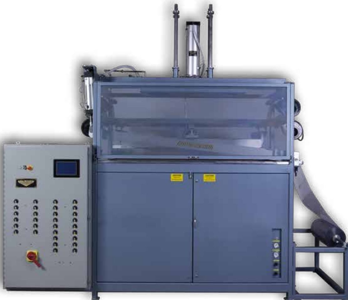
STANDARD SAT SERIES AUTOMATIC VACUUM FORMING MACHINE SHOWN WITH OPTIONAL PLUG/GRID ASSIST

EXPERIENCE the STARVIEW ADVANTAGE INNOVATIVE PACKAGING MACHINES