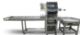
AITS-1216 & 1220