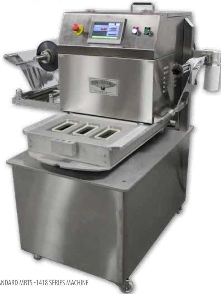
STANDARD MRTS -1418 SERIES MACHINE

EXPERIENCE the STARVIEW ADVANTAGE INNOVATIVE PACKAGING MACHINES