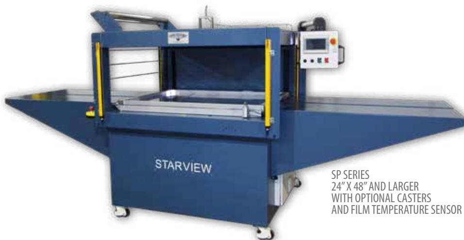
SP SERIES 24" X 48" AND LARGER WITH OPTIONAL CASTERS AND FILM TEMPERATURE SENSOR