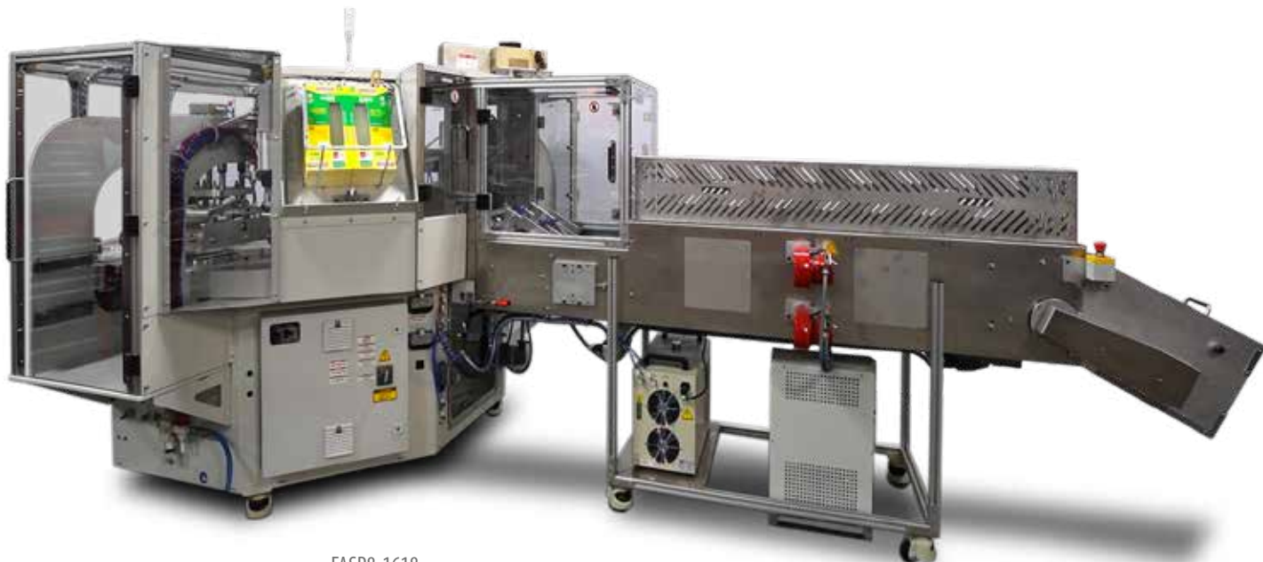
FASP8-1618 FULLY AUTOMATIC STRETCH PAK MACHINE

EXPERIENCE the STARVIEW ADVANTAGE INNOVATIVE PACKAGING MACHINES