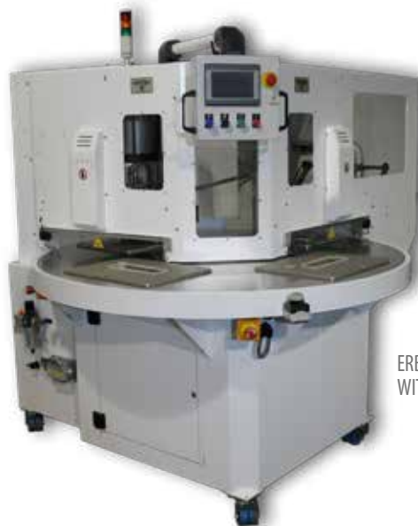
ERB/PH4 WITH OPTIONAL UNLOAD AND CASTERS

EXPERIENCE the STARVIEW ADVANTAGE INNOVATIVE PACKAGING MACHINES