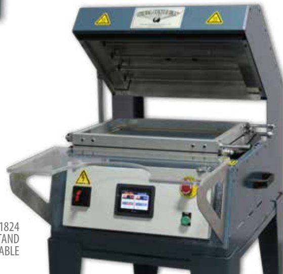
MSP-1824 WITH OPTIONAL FLOOR STAND AND OUT-FEED TABLE

EXPERIENCE the STARVIEW ADVANTAGE INNOVATIVE PACKAGING MACHINES