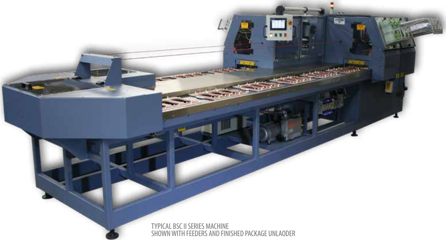
TYPICAL BSC II SERIES MACHINE SHOWN WITH FEEDERS AND FINISHED PACKAGE UNLAODER

EXPERIENCE the STARVIEW ADVANTAGE INNOVATIVE PACKAGING MACHINES