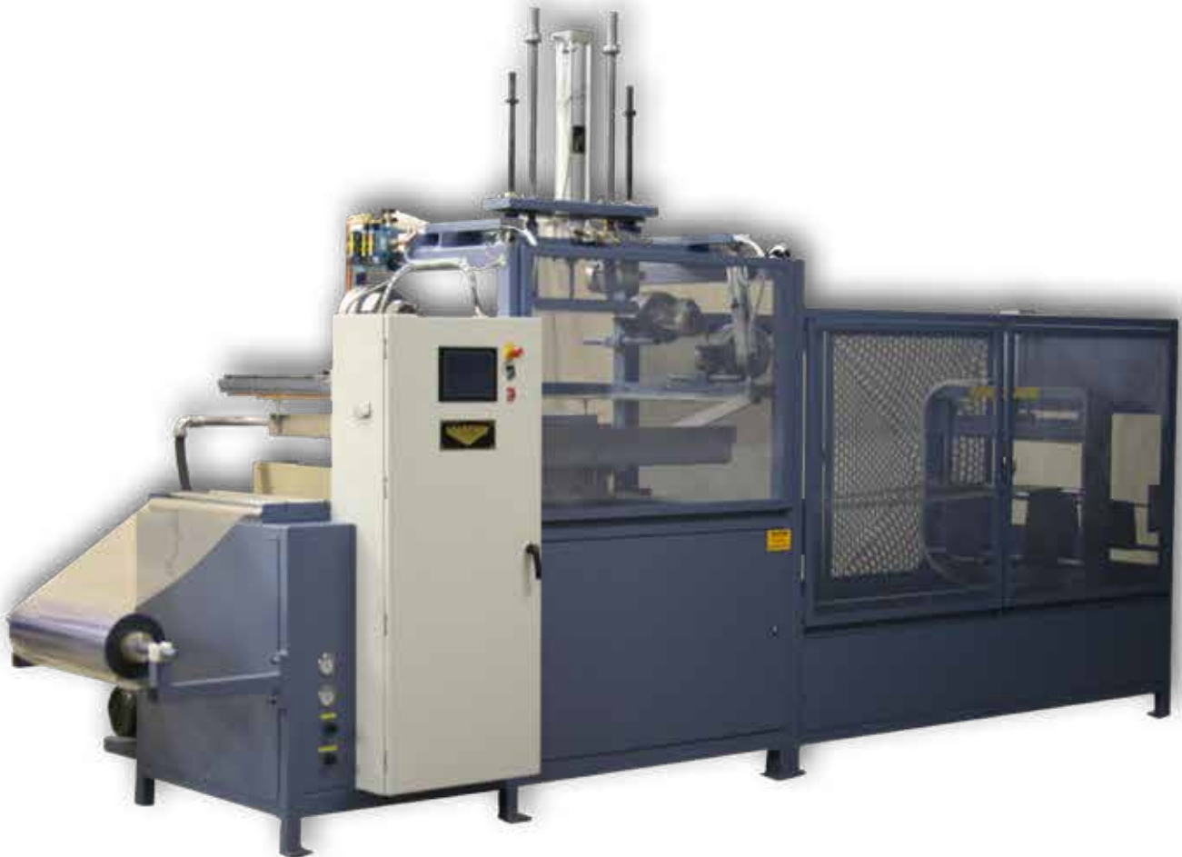
STANDARD FOM SERIES AUTOMATIC VACUUM FORMING MACHINE SHOWN WITH OPTIONAL PLUG/GRID ASSIST

EXPERIENCE the STARVIEW ADVANTAGE INNOVATIVE PACKAGING MACHINES