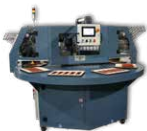
BLISTER & CLAMSHELL