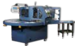
FAB WITH APB