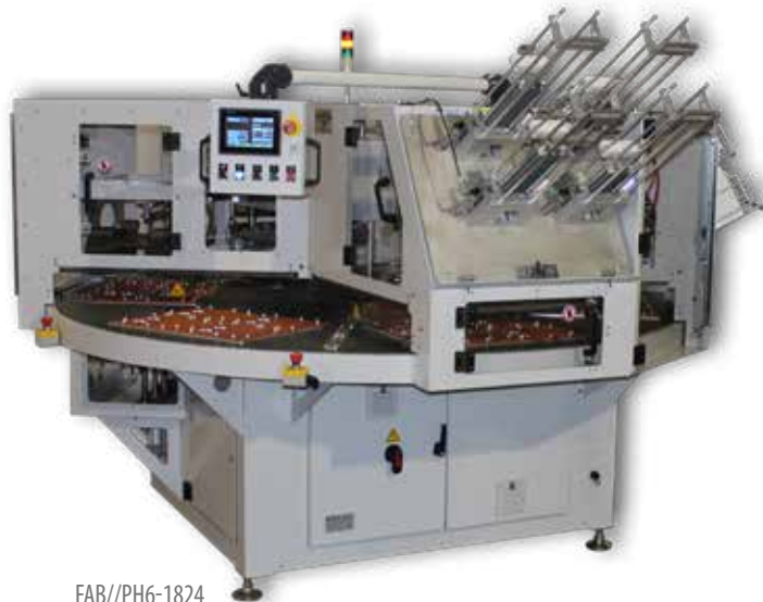
FAB//PH6-1824 WITH OPTIONAL PRODUCT FEEDER, AND FOLDOVER