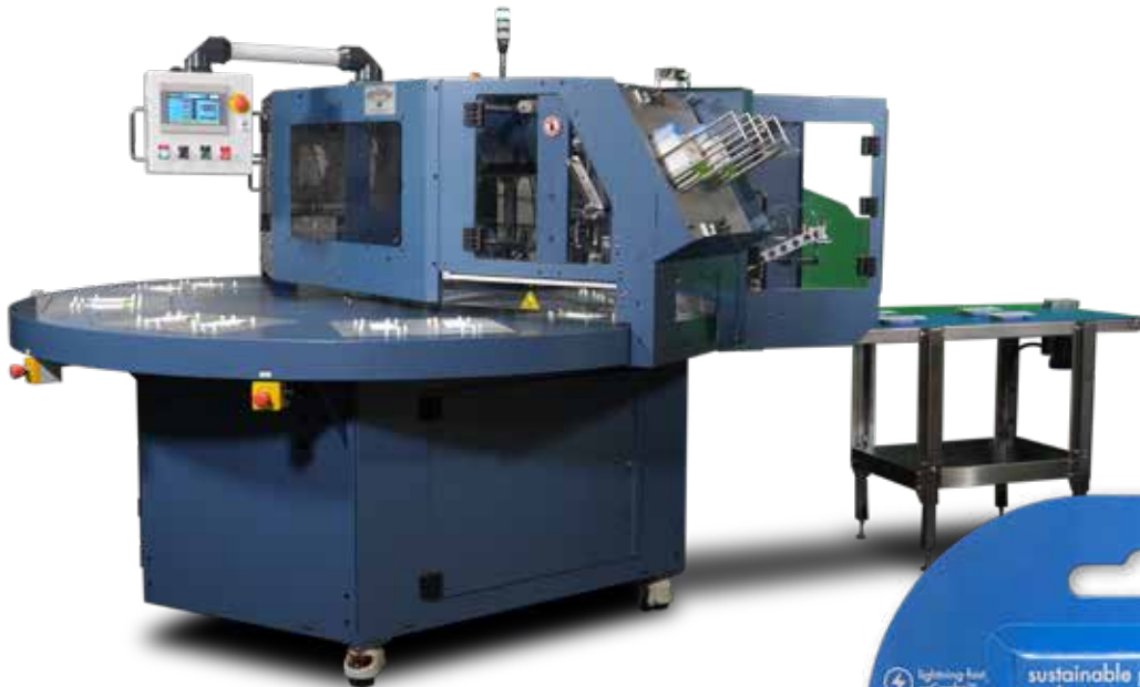
FAB8-1418-APB WITH STAND ALONE FEEDER AND UNLOAD CONVEYOR