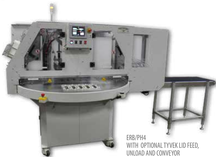
ERB/PH4 WITH OPTIONAL TYVEK LID FEED, UNLOAD AND CONVEYOR