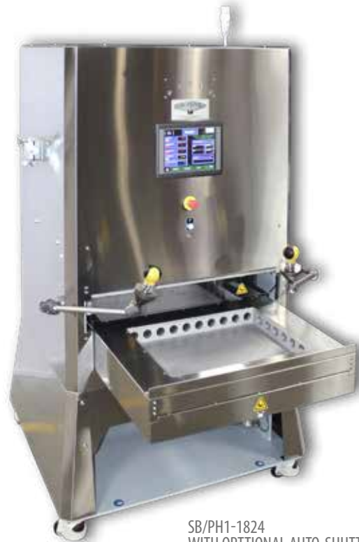
SB/PH1-1824 WITH OPTIONAL AUTO-SHUTTLE AND CASTERS

EXPERIENCE the STARVIEW ADVANTAGE INNOVATIVE PACKAGING MACHINES