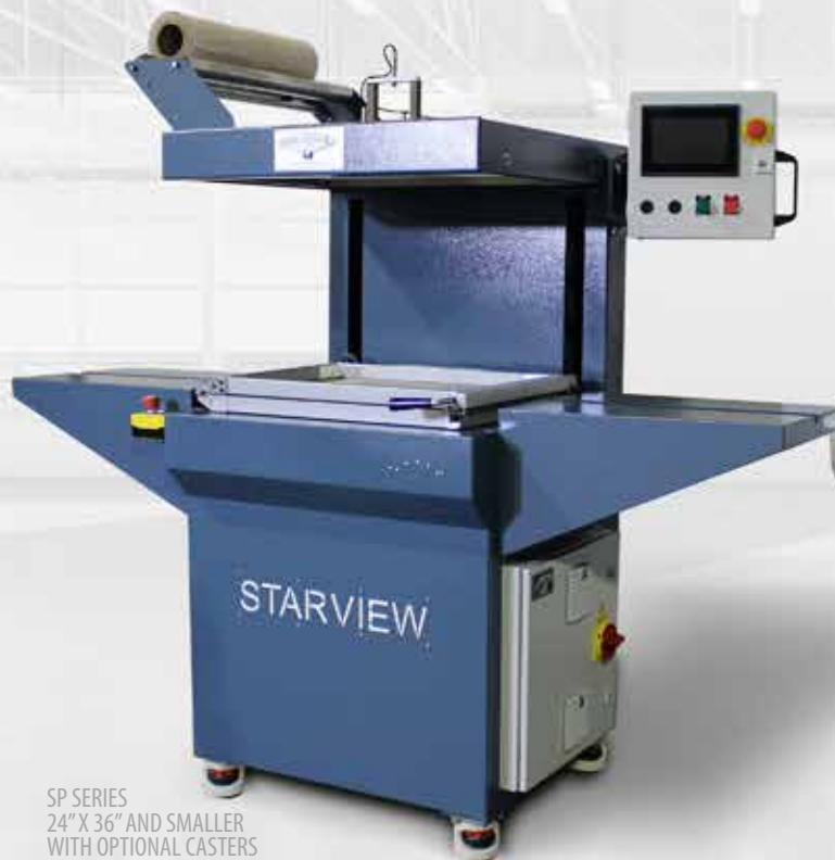
SP SERIES 24" X 36" AND SMALLER WITH OPTIONAL CASTERS AND FILM TEMPERATURE SENSOR

FROM MANUAL TO SEMI-AUTOMATIC TO FULLY AUTOMATIC SKIN PACKAGING MACHINES