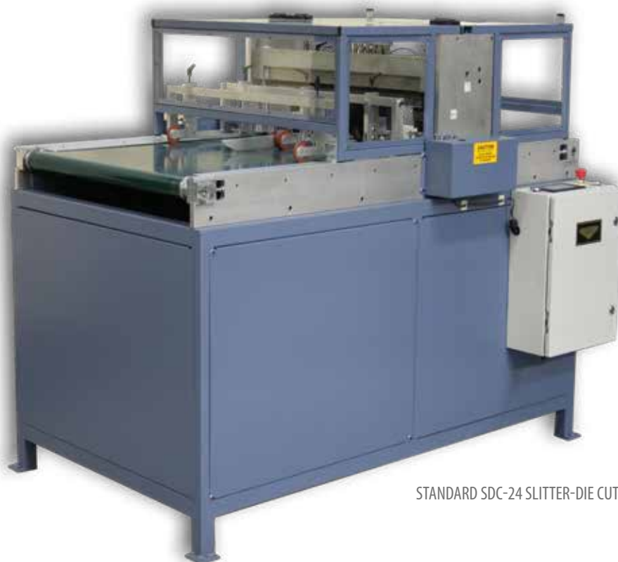
STANDARD SDC-24 SLITTER-DIE CUTT

EXPERIENCE the STARVIEW ADVANTAGE INNOVATIVE PACKAGING MACHINES