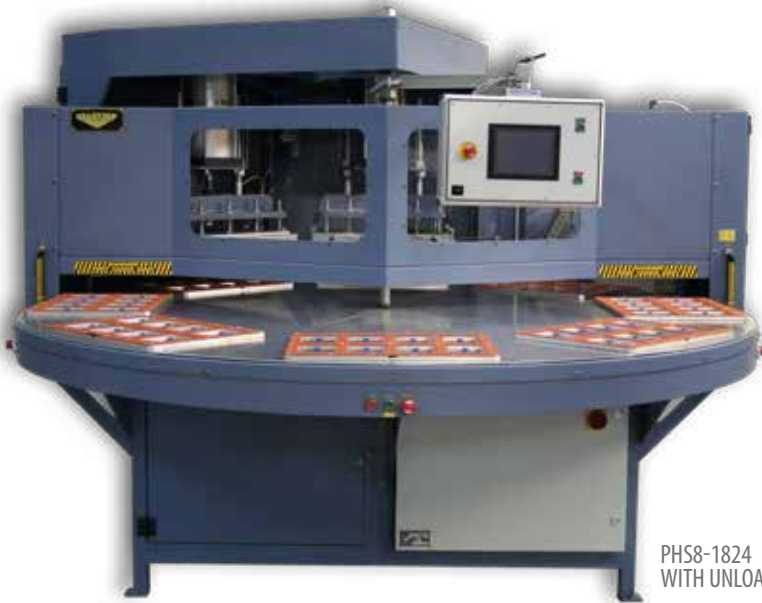
PHS8-1824 WITH UNLOADER