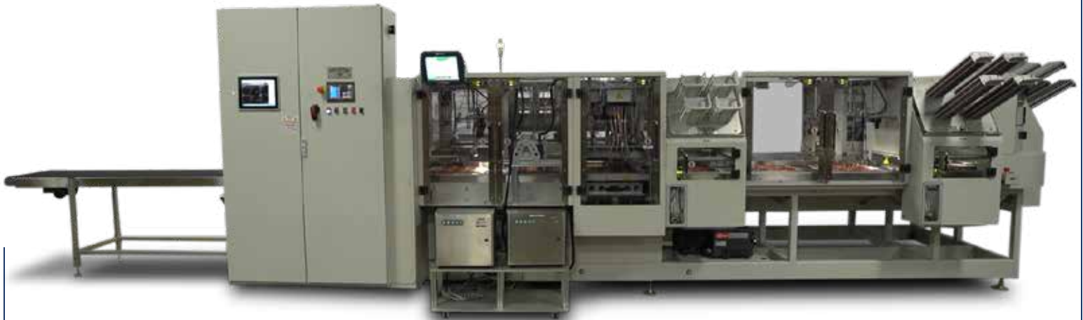
BSC/PH II - 1418 MACHINE

EXPERIENCE the STARVIEW ADVANTAGE INNOVATIVE PACKAGING MACHINES