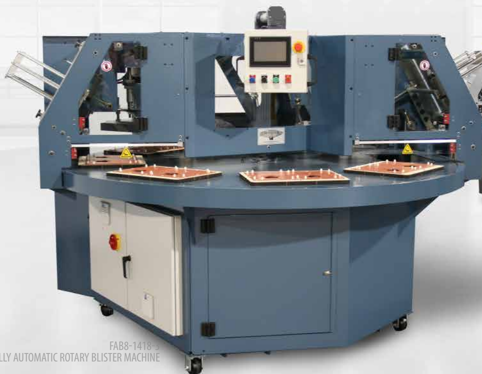
FAB8-1418-3 FULLY AUTOMATIC ROTARY BLISTER MACHINE

FROM MANUAL SHUTTLES, TO SEMI-AUTOMATIC ROTARIES TO FULLY AUTOMATIC ROTARIES, CAROUSELS & INLINE PACKAGING MACHINES