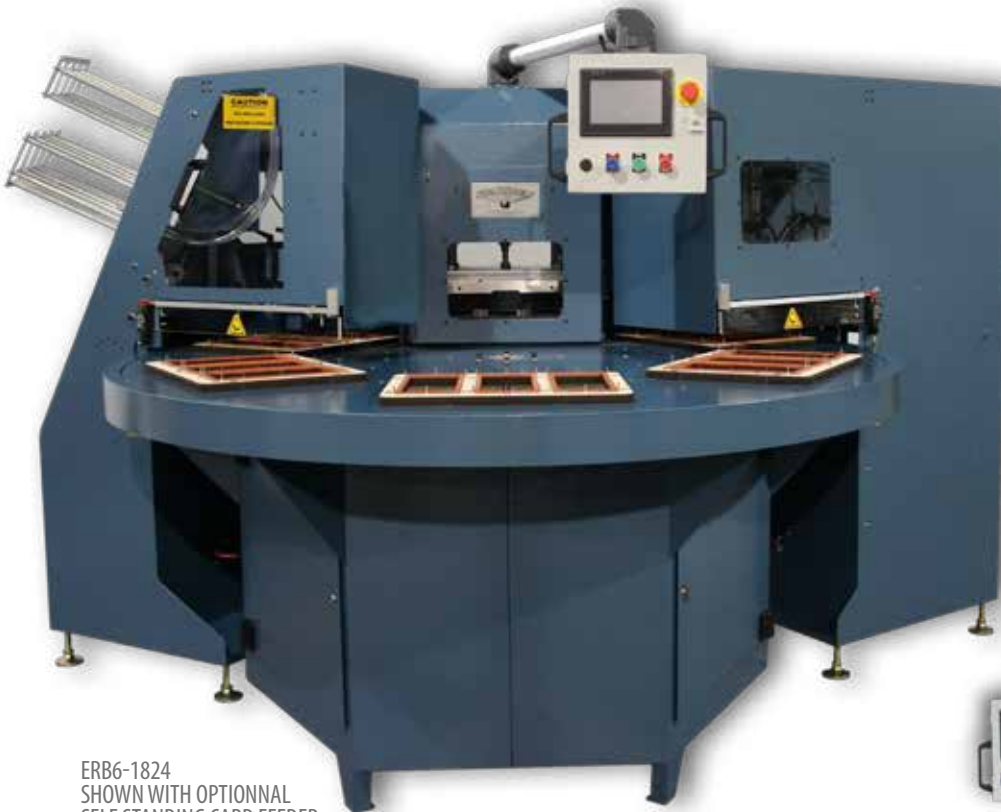
ERB6-1824 SHOWN WITH OPTIONNAL SELF STANDING CARD FEEDER AND SELF STANDING FINISHED PACKAGE UNLOADER