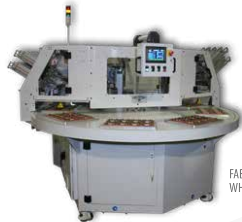
FAB8-1418 WHITE FINISH

For machines capable of higher finished package volumes or with additional open stations for automation please consider Starview's BSC Series Carousel or CBS Series Inline machines .