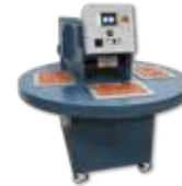
RB4 / RB6