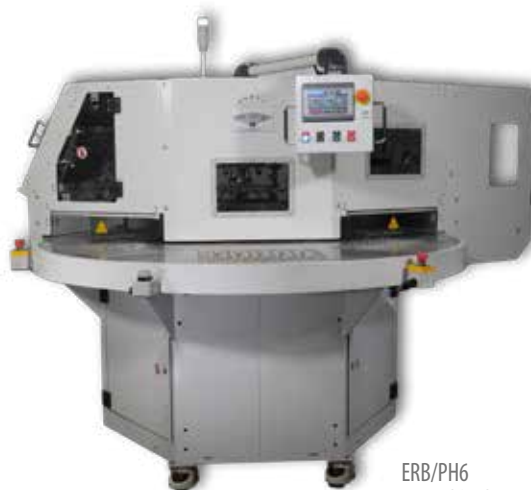
ERB/PH6 WITH OPTIONAL TYVEK LID FEED, UNLOAD AND CASTERS