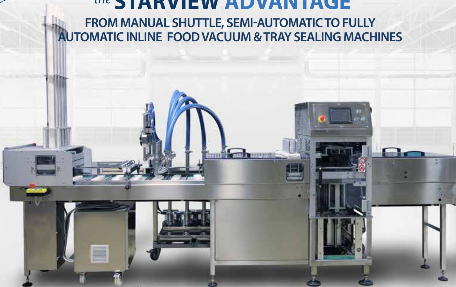
AITS-1216 WITH OPTIONAL TRAY FEEDER, PRODUCT LOADING AND UNLOAD WEIGH CHECK

FROM MANUAL SHUTTLE, SEMI-AUTOMATIC TO FULLY AUTOMATIC INLINE FOOD VACUUM & TRAY SEALING MACHINES