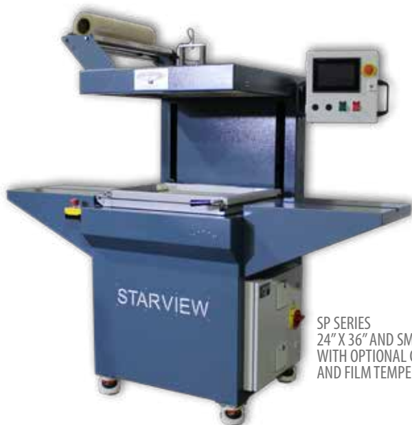
SP SERIES 24" X 36" AND SMALLER WITH OPTIONAL CASTERS AND FILM TEMPERATURE SENSOR