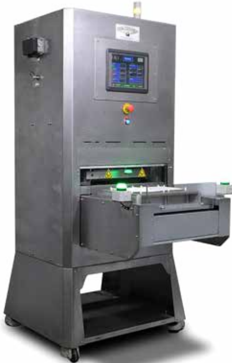
SB/PH1-1418 WITH OPTIONAL ALL ELECTRIC DRIVE, AUTO SHUTTLE AND CASTERS