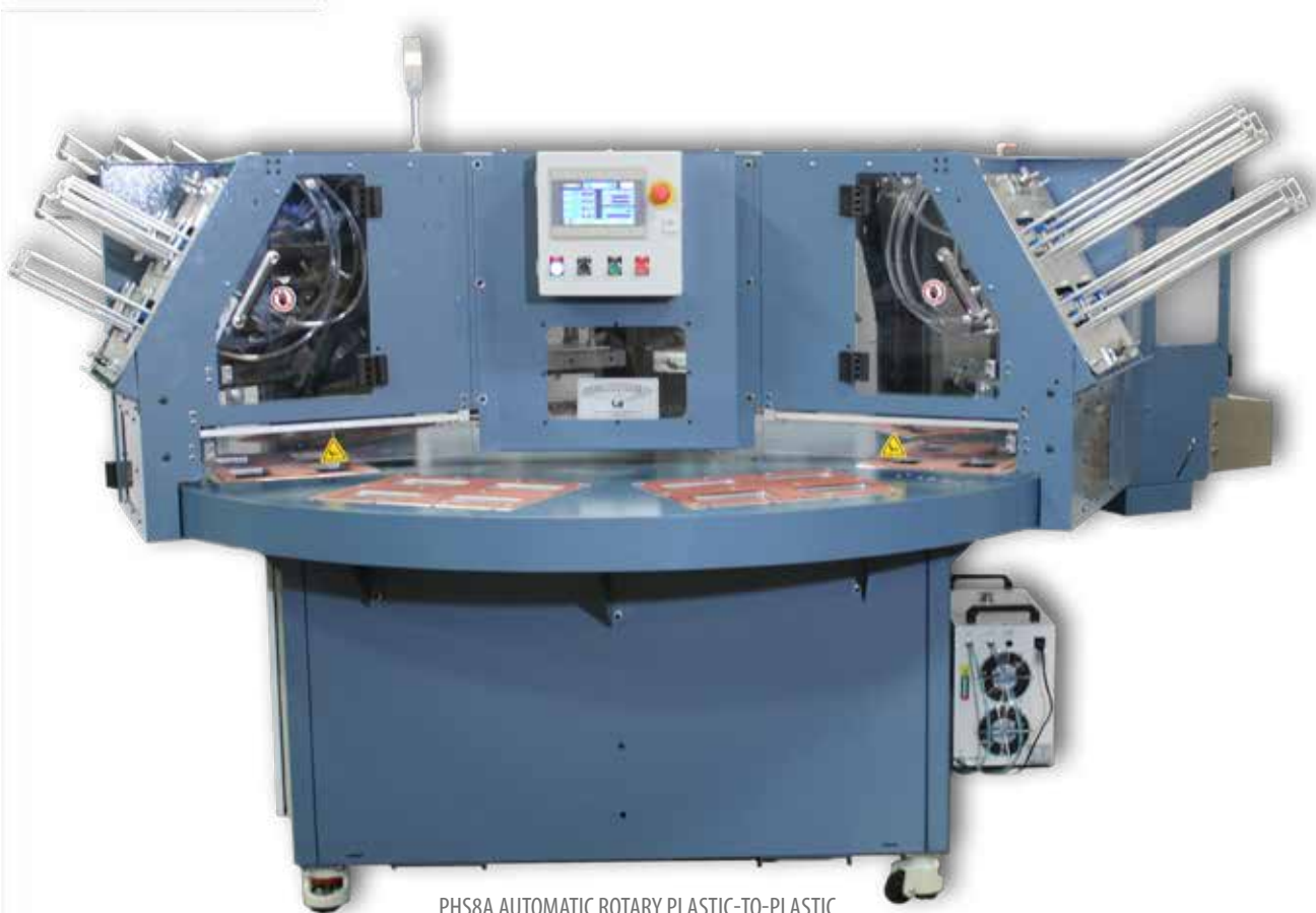
PHS8A AUTOMATIC ROTARY PLASTIC-TO-PLASTIC CLAMSHELL AND BLISTER SEALING MACHINE

EXPERIENCE the STARVIEW ADVANTAGE INNOVATIVE PACKAGING MACHINES