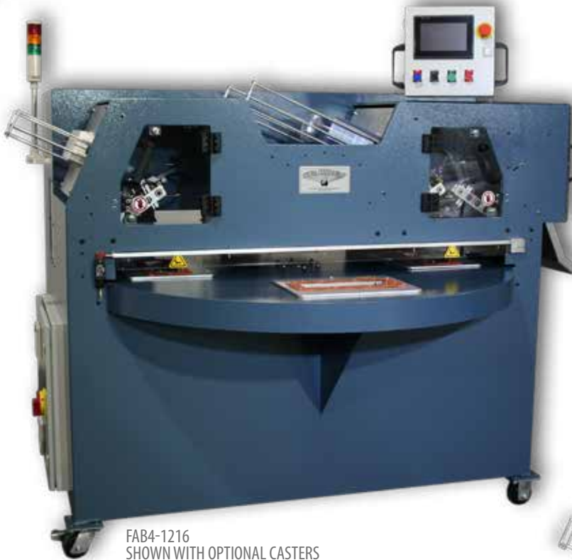
FAB4-1216 SHOWN WITH OPTIONAL CASTERS AND LIGHT TOWER