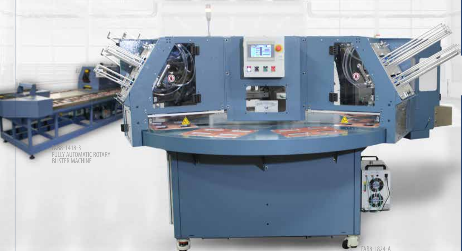
FAB8-1418-3 FULLY AUTOMATIC ROTARY BLISTER MACHINE

FROM SEMI-AUTOMATIC ROTARY TO FULLY AUTOMATIC INLINE PACKAGING MACHINES.