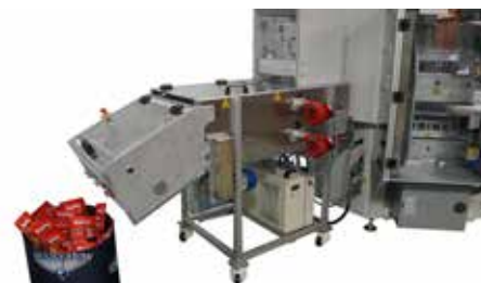
UNLOAD STATION WITH PACKAGE SLITT