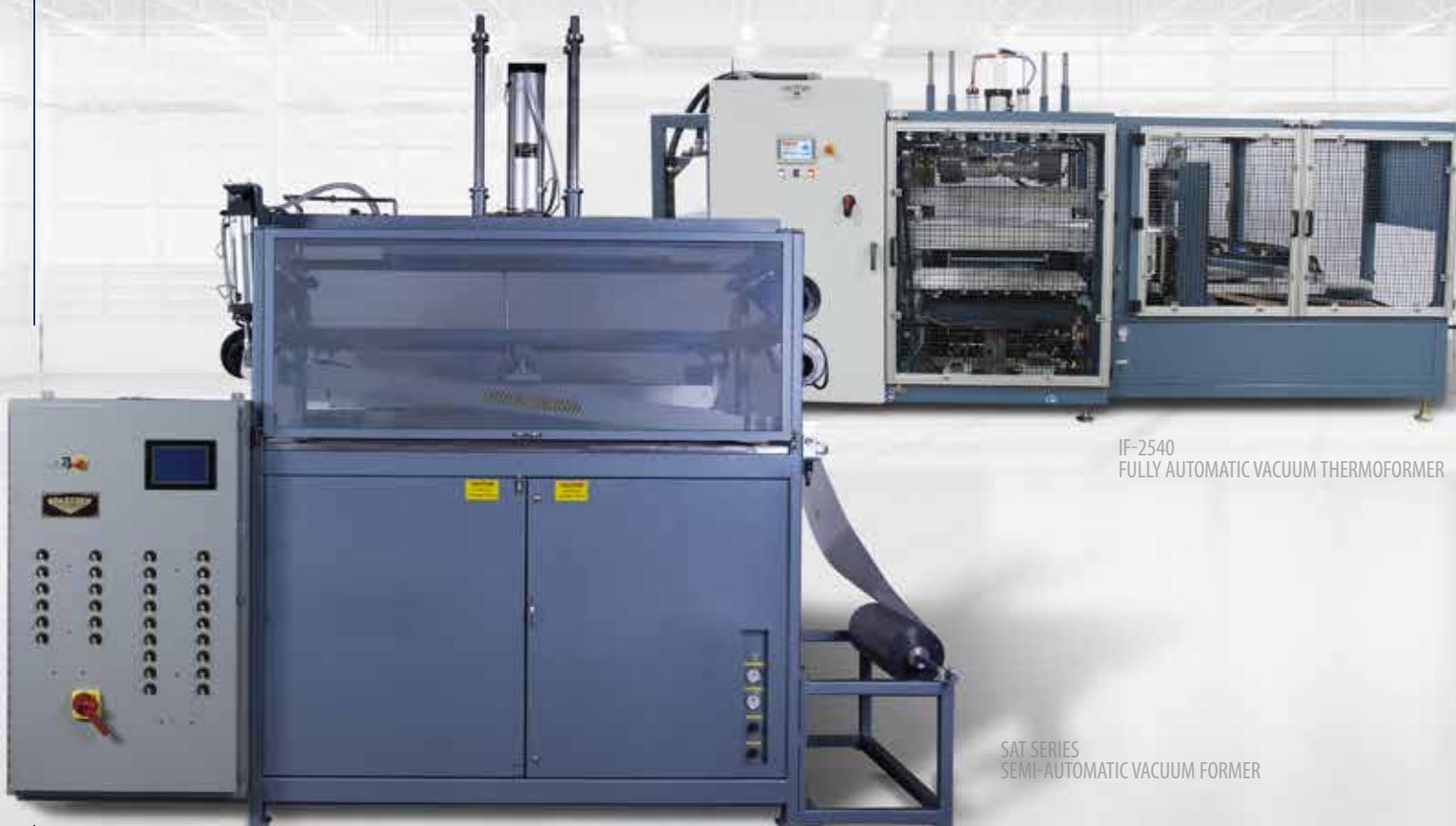
IF-2540 FULLY AUTOMATIC VACUUM THERMOFORMER

FROM SEMI-AUTOMATIC VACUUM FORMERS TO FULLY AUTOMATIC INLINE VACUUM & PRESSURE FORMERS